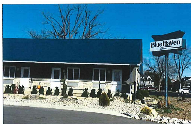
Figure 3 Landscaped grounds around Blue Haven Apartments