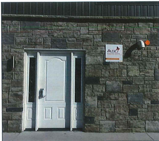
Figure 4 Entrance to support services for apartment residence and the community