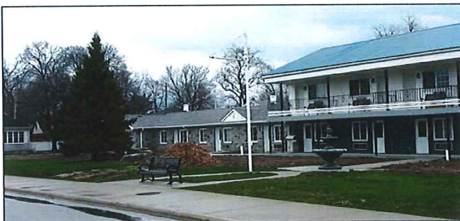
Figure 1 Blue Haven Apartments in Amherstburg, Ontario