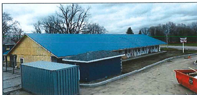
Figure 2 Blue Haven Motel under renovation to affordable housing

“Making choices like these during the construction can help keep my long-term costs down, and allow me to rent my units out for anywhere up to twenty per cent below market rates.”