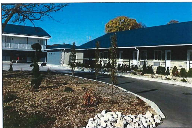
Figure 6 Blue Haven Apartments including former garage now a support service office

During the redevelopment, Nasr set aside one of the Blue Haven units as a permanent office and resource space for the group. In return, A.L.S.O. staff now work out of the office 24 hours a day, 365 days a year, to help the tenants who have physical disabilities with everything from personal care and daily living tasks, to social recreation and counselling.