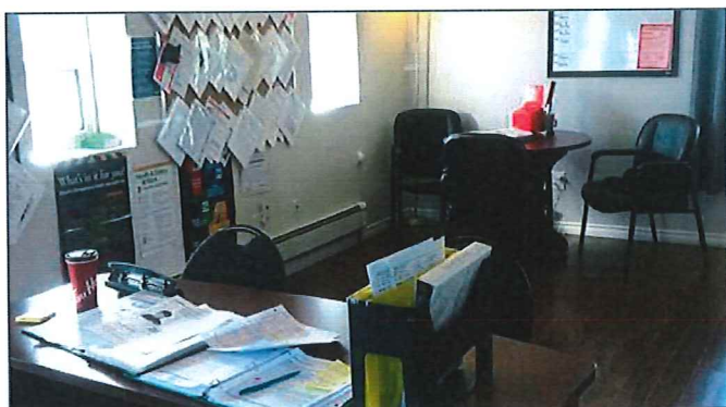
Figure 5 Support service office – A.L.S.O. (Assisted Living Southwestern Ontario)